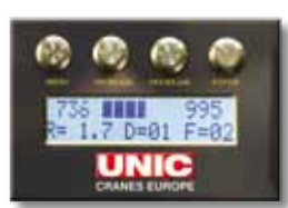
Full safe load indicator