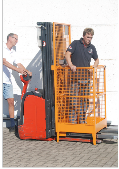
Type MB-I with straddle stacker