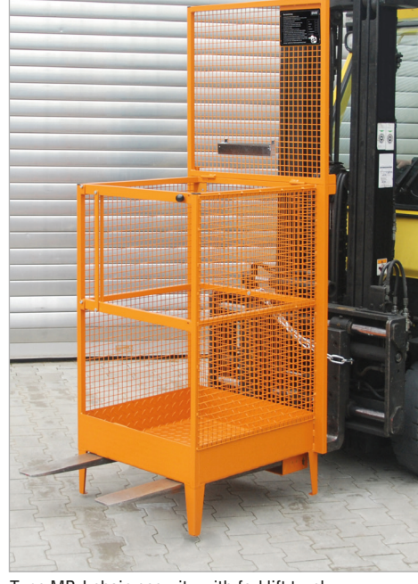
Type MB-I chain security with forklift truck