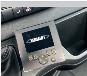
Userfriendly display in the cabin

Userfriendly display in the cabin Eco start/stop Auto-door lock Available in most colors