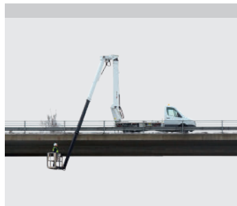
Ability to work below ground level (-3,3 meters)