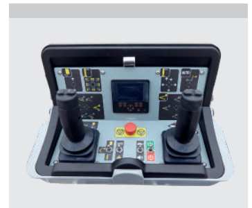
FPC (Full Proportional CANbus controls): Up to 4 simultaneous actions (2 per joystick)