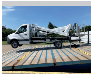
6° leveling depending on vehicle position